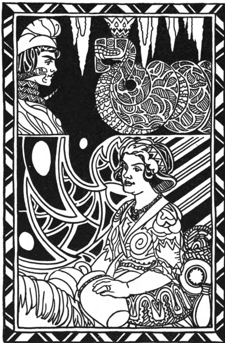
The Tear of the Snakes Listened Carefully